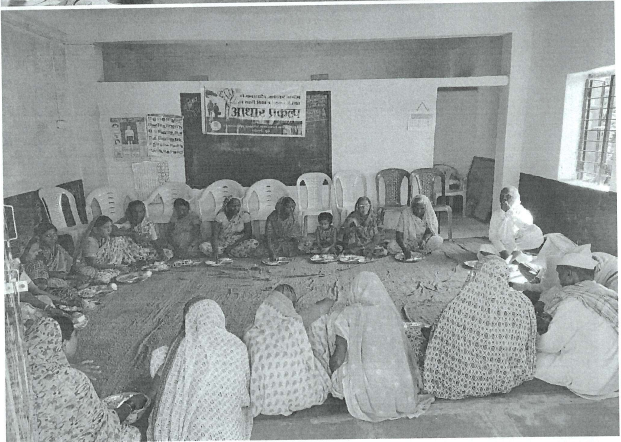
Children and peoples were taking food.