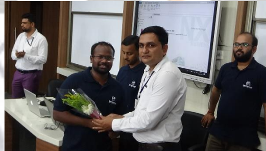
Fig2: MECHANICAL DEPT FACULTY FALICITATING THE EXPERTS