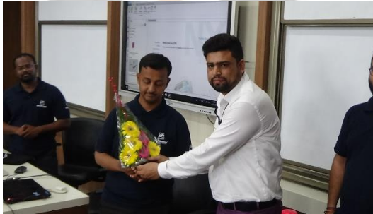
Fig1: MECHANICAL DEPT COORDINATOR FALICITATING THE EXPERTS FROM CAD-CAM GALAXY & SIEMENS