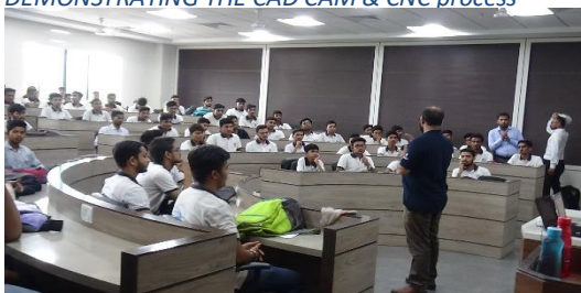
Fig5: EXPERTS INTERACTING WITH THE STUDENTS