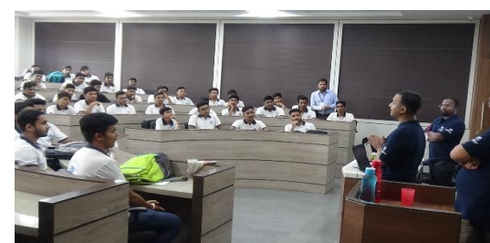
Fig6: EXPERTS INTERACTING WITH THE STUDENTS