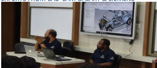
Fig3: CAD_CAM_GALAXY_ & SIEMENS_TEAM_ DEMONSTRATING THE CAD CAM & CNC process