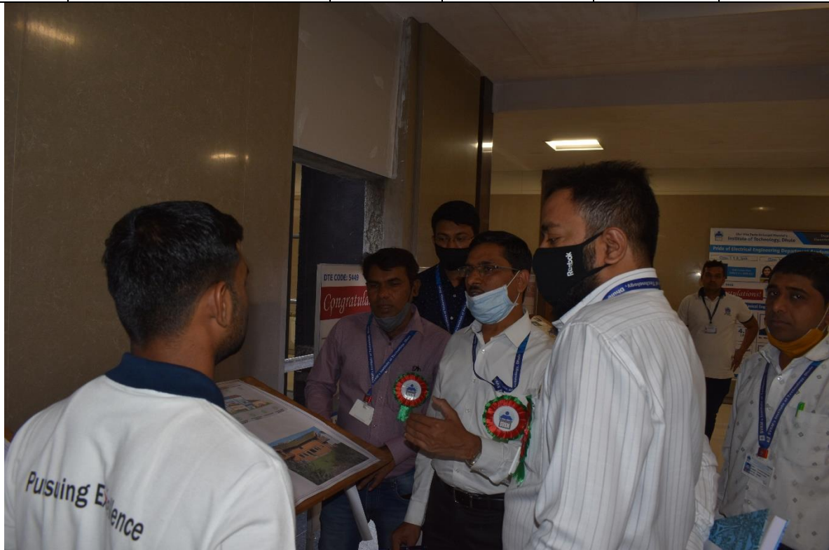
Judges evaluating the participants