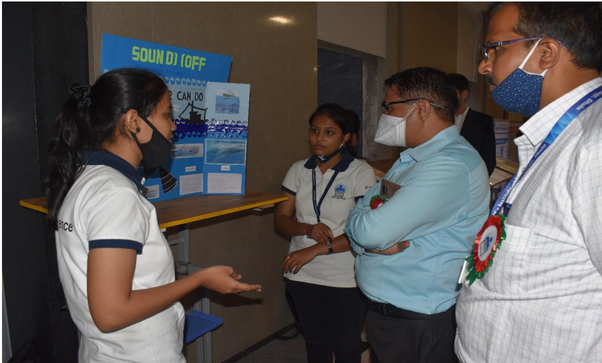
Hon'ble Principal and HOD interacting with the participants