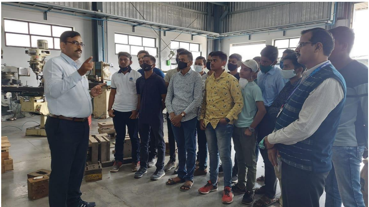
Manager of Nitiraj Ind while instructing to the students about the sections of the industry.