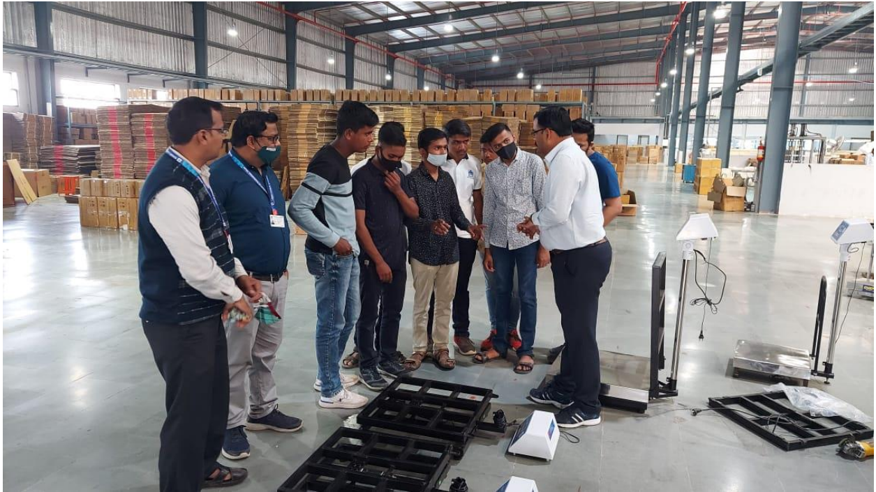
Manager of Nitiraj Ind. while interacting with students about working and designing of weight balance.