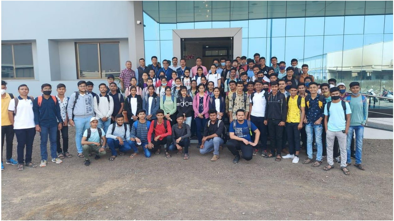
First Year newly admitted students visited to Neetiraj Engineers PVT Ltd, MIDC Avadhan, Dhule