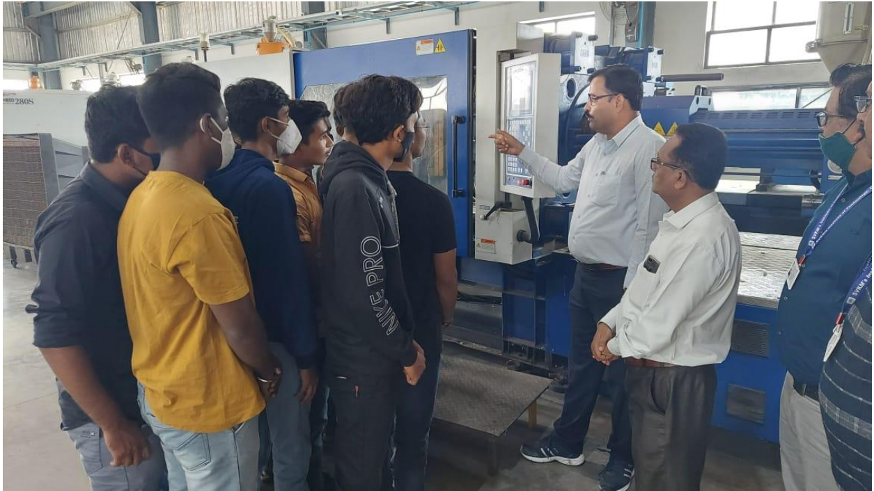
Manager of Nitiraj Ind. introduces about CNC based machineries working and operating procedure.