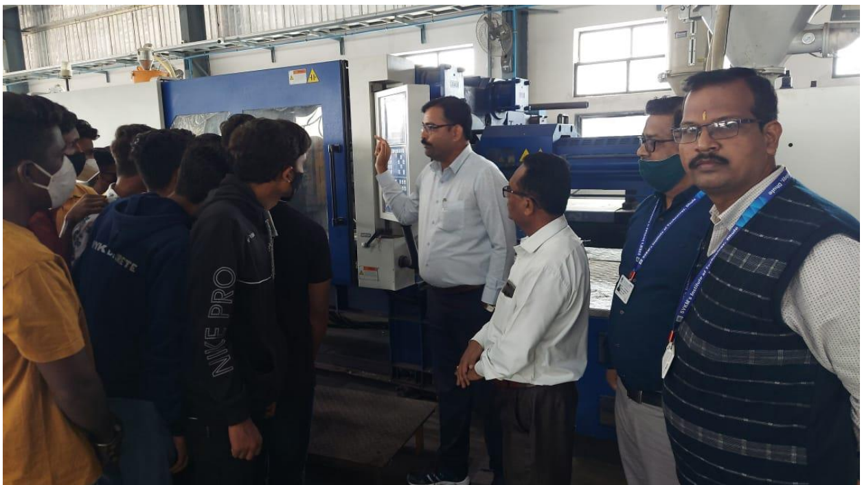
Manager of Nitiraj Ind. informing about CNC based machineries working and operating procedure.