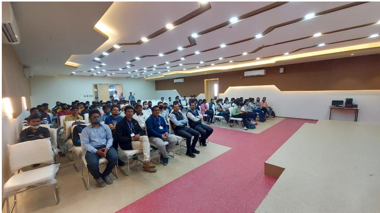
Visiting students and staff at Nitiraj Ind.