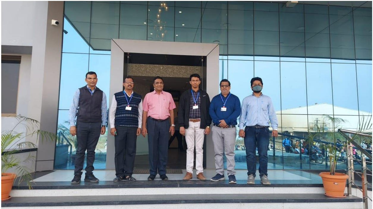
First Year Faculties