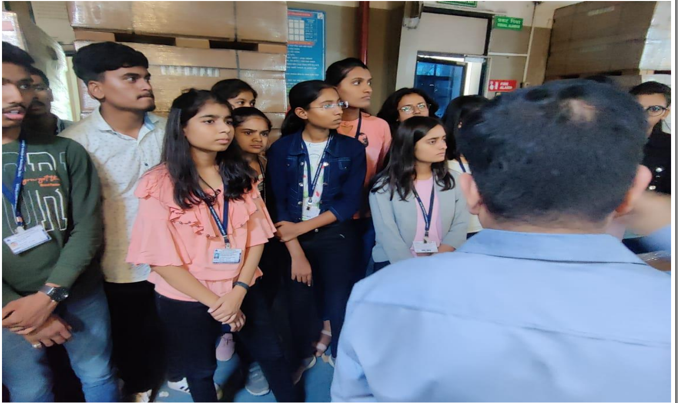
Manager of the Company informing to the students about the Plant.