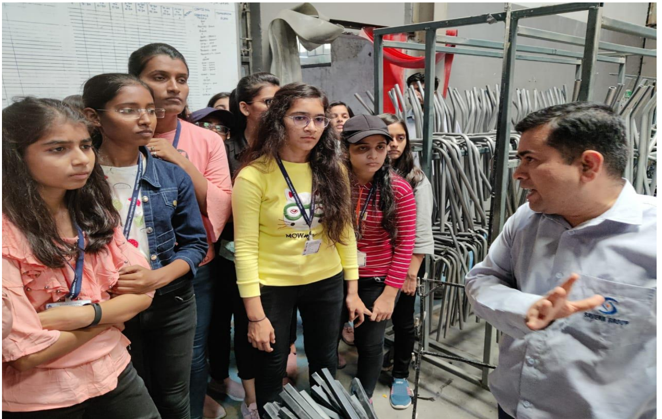
Manager of the Company informing to the students about the functioning.