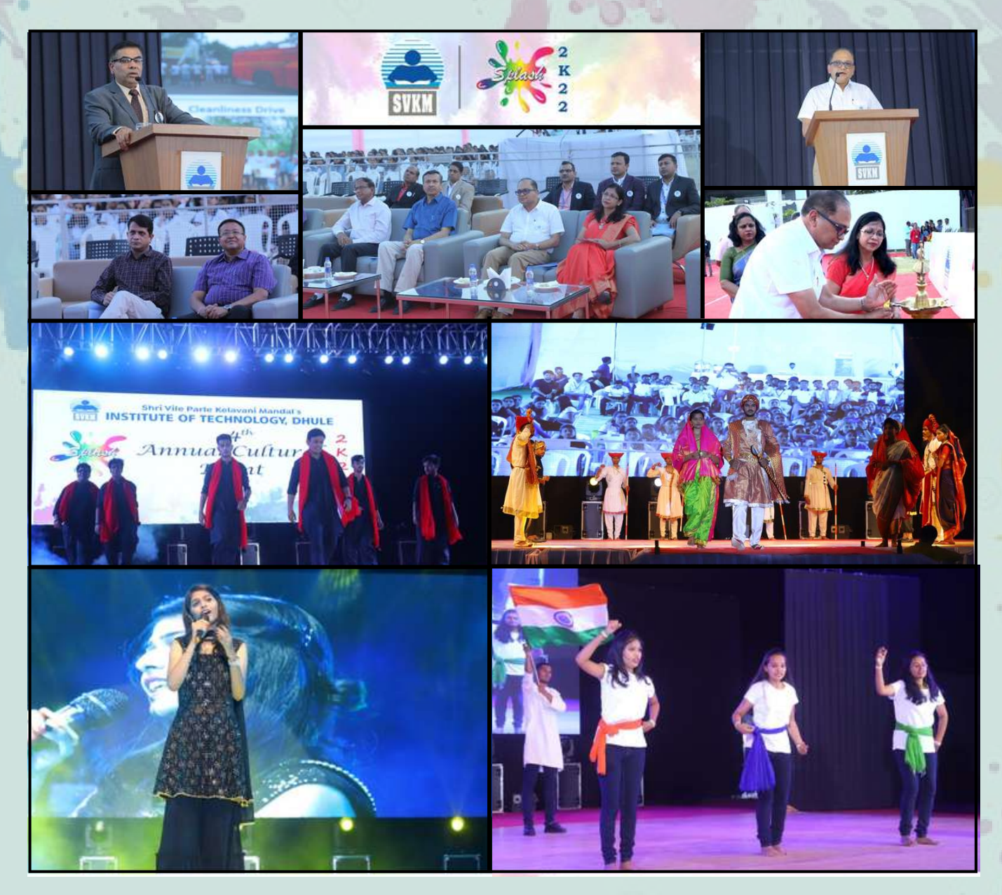
SPLASH in Nutshell

The Final Day of Grand Annual Event be like the students were anchoring different segments of the function with a view to work as a team. The cultural activities performed by the students exhibit their hidden talents. The students always needed an outlet to showcase their potential and creativity and indeed this became the best platform for them.