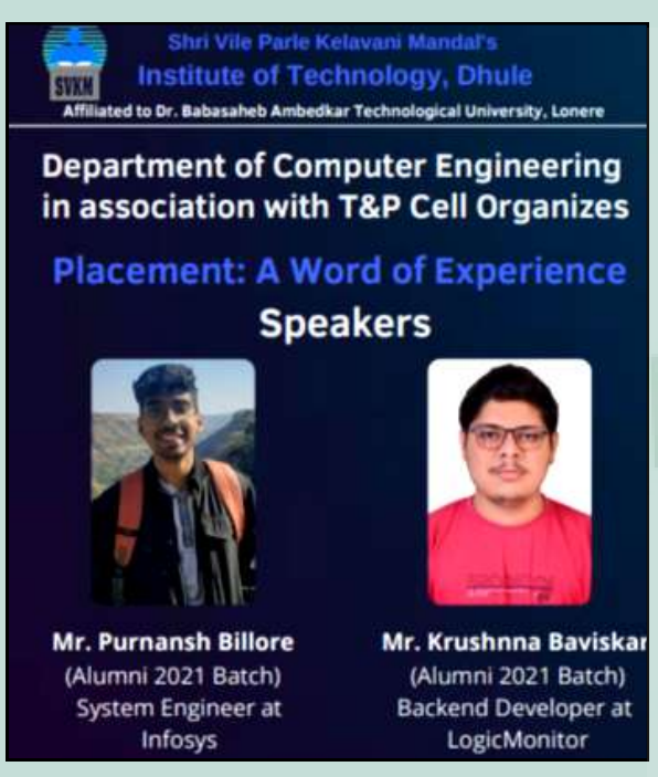
Word of Experience