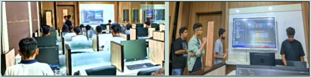
Glimpses of the Workshop